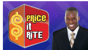
Price it Rite