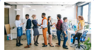
Speed Networking Workshop