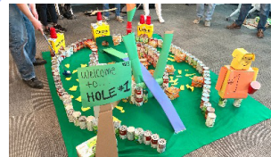
Mini-Golf & Give