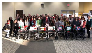
Charity Wheelchair Build