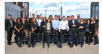
Charity Rollator Build