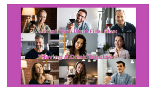
Virtual Team iHunt™