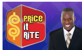
Virtual Price it Rite