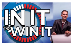
Virtual In It to Win It