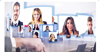
Virtual Speed Networking Workshop