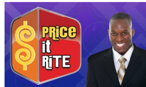
Virtual Price it Rite